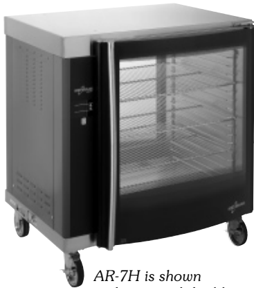
AR-7H is shown with optional double pane curved glass doors and electronic control.

AR-7H The companion holding cabinet includes heavy duty, non-magnetic stainless steel construction throughout. The cabinet is controlled by one (1) ON/OFF power switch, one (1) adjustable thermostat, 60° to 200°F (16° to 93°C); includes one (1) indicator light; and one (1) holding temperature gauge to monitor inside air temperature. Single pane, low-e glass door and magnetic latch on the control side is hinged right. On the non-control side, the door is hinged left. One (1) rugged, easy-grip curved handle located on the control side and one (1) set of 5" (127mm) casters are included.